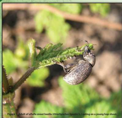
Figure 1: Adult alfalfa snout beetle ( Otiorhynchus ligustici L.) sitting on a young hop shoot.

Hop Research Institute, Co., Ltd., Kadaňská 2525, Žatec, Czech Republic, e-mail: j.vostrel@telecom.cz