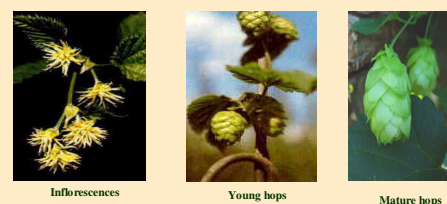
Figure 1: Developmental stages of hop cones sampled in this study. Three developmental stages, from flowering up to full developed cones were analyzed.