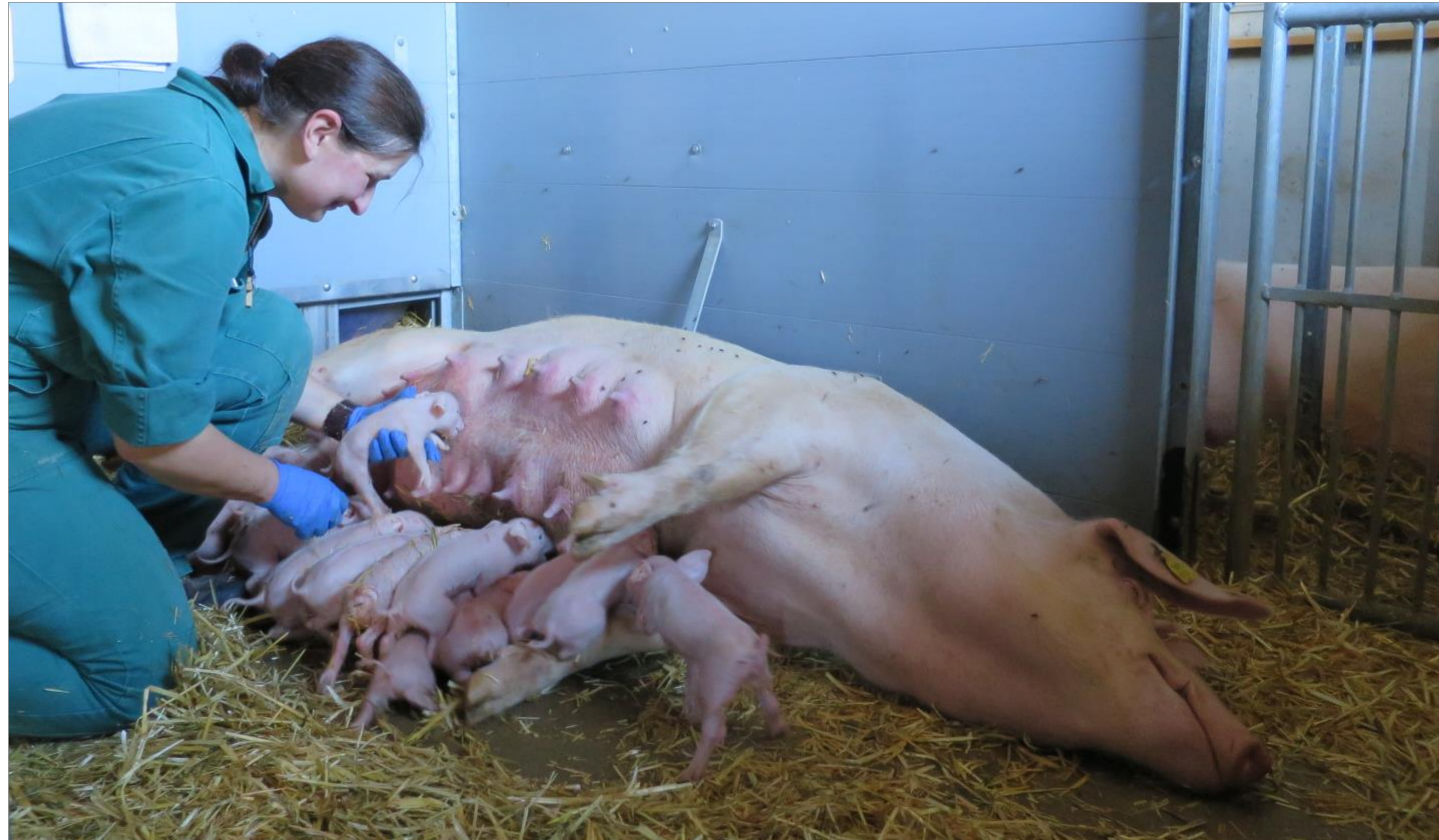
Figure 1: Not aggressive sows make work easier

Piglets have to undergo several routine husbandry procedures in the first days after birth. This clashes, however, with the sow's behavioural need to be left undisturbed with her piglets during this period. Consequently, some sows tend to defend their piglets (Andersen et al. 2005, Jensen 1986). As many organic farms have farrowing crates with no fixation, sow defensive behaviour can be quite dangerous for the farmer. The aim of this study was to develop a behavioural scoring system for the ease of handling (EOH) of lactating sows and to determine the impact of EOH on reproductive performance.