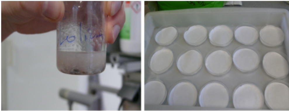
Figure 1. Jellyfish liquid and petri plates used in this study

Pot culture experiment: The 50 pots were filled with sandy clay soil. 5 seeds were put in each pots at 0.5 cm soil depth and irrigated with jellyfish solution (30 ml). The room temperature was constantly 22\pm 1^\circ\text{C} . To simulate drought conditions all pots were watered only two times (40 ml and 20 ml for each pot) during the experiment. After 6 and 12 days, soil moisture were measured by ProCheck (PC 1, 2007) to calculate the water-filled pore space (WFPS). WFPS has been widely applied and it is useful for measuring the influence of moisture on soil biological activity because it includes information about the impact of soil water on aeration (Paul, 2007), and it is calculated as follows (Franzluebbers, 1999): \text{WFPS}(\%) = 100 * \text{SWC} / (1 - \text{BD} / \text{PD}) ; where SWC is the soil water content ( \text{g g}^{-1} ), BD is the soil bulk density ( \text{Mg m}^{-3} ), and PD is the particle density ( 2.65 \text{ Mg m}^{-3} ).