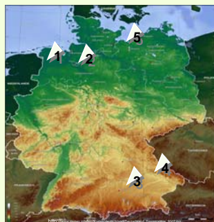
Figure 2: Map of Germany showing the five experimental sites (for numeration, cf. to 'Material').

The detection of possible changes in SNP allele compositions between original genotypes and genotypes in the trial field after four years of cultivation (starting material: two visually fittest varieties in trial locations vs. two visually least fit varieties) is performed via Pyrosequencing. The evaluation of phenotypic data (e.g. visible changes in variety appearance, Fig. 3) and the analysis of correlations to the PSQ results (Fig. 4) is used for investigating the "persistence" components. The knowledge of those interacting components leads to the development of selection methods for the trait "persistence". Genetic drift, e.g. changes in the phenotypic scoring from "less winter hard" to "winter hard", will be analyzed within and between the varieties at different sites, too.