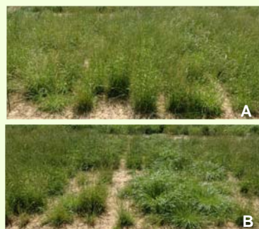
Figure 3: Mixtures of genotypes and winter survival of the variety "Guru" from the sites Hötzelndorf (A, mountainous) and Schmalenbeck (B, moor) after four years of cultivation, with drastic phenotypic changes being visible at Schmalenbeck.