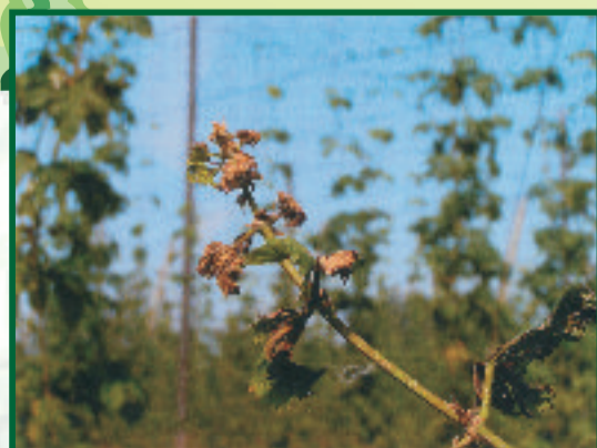
Figure 3: Typical "spike" caused by heavy infection of downy mildew during spring time