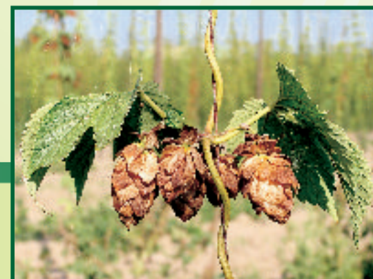
Figure 5: Damage caused by downy mildew on cones in a hop-garden