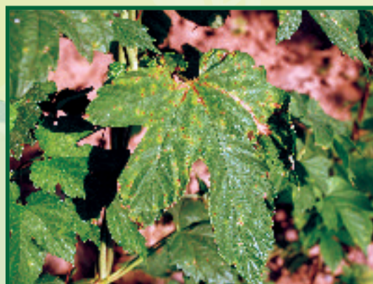
Figure 4: Damage caused by downy mildew on leaves – typical brown blotches