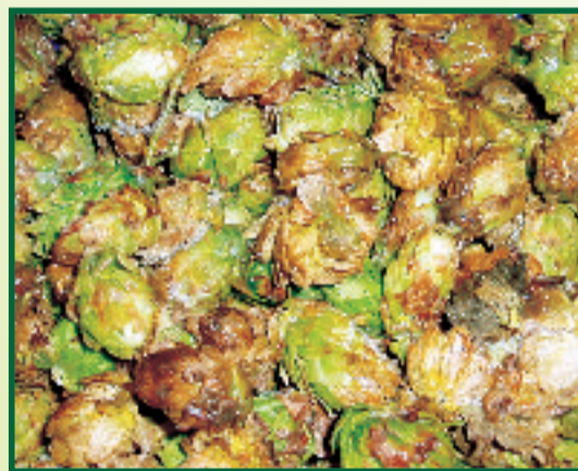
Figure 1: Hop cones damaged by downy mildew