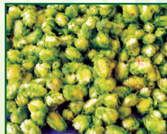
Figure 2: Hop cones free from downy mildew symptoms