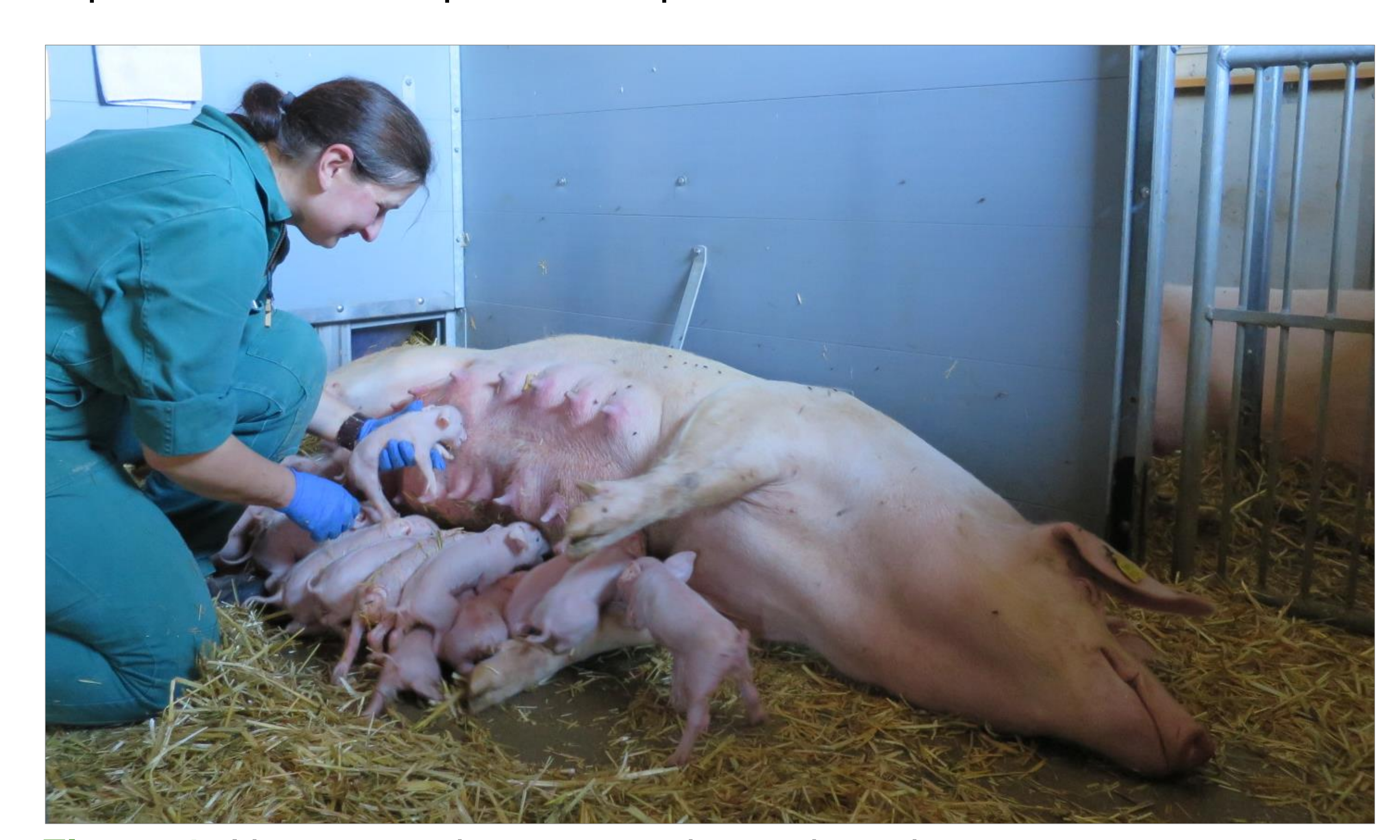
Figure 1: Not aggressive sows make work easier

Piglets have to undergo several routine husbandry procedures in the first days after birth. This clashes, however, with the sow's behavioural need to be left undisturbed with her piglets during this period. Consequently, some sows tend to defend their piglets (Andersen et al. 2005, Jensen 1986). As many organic farms have farrowing crates with no fixation, sow defensive behaviour can be quite dangerous for the farmer. The aim of this study was to develop a behavioural scoring system for the ease of handling (EOH) of lactating sows and to determine the impact of EOH on reproductive performance.