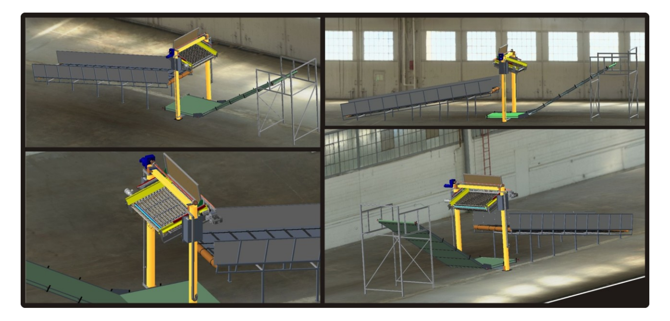
Figure 3. Digital prototype of the automated hop picking machine feeding system

The presented concept of the automated feeding of a hop picking machine is a unique approach, which implies the development of a novel system. Similar projects in the past were accompanied with significant number of errors which were able to eliminate by trials involving additional time and causing extra costs. To avoid such a problem a digital prototype of the system was built allowing tests based on simulation. In the first phase the sketches created during the concept development and existing technical drawings were reviewed and converted into 3D solid models. The models of the existing parts for which technical documentation was not available were created using reverse engineering. In order to provide modularity of the system, already during the concept development, lifting systems common in construction, packaging and assembly industry were evaluated. On such a way and using concurrent engineering the digital prototype was built step by step using Product Design Suite 2012 (Autodesk). Additionally, for most important mechanisms, simulation-ready models were created to carry out kinematical simulations, stress and force analysis. A screenshot presenting the digital prototype of the testing facility is shown in the figure 3.