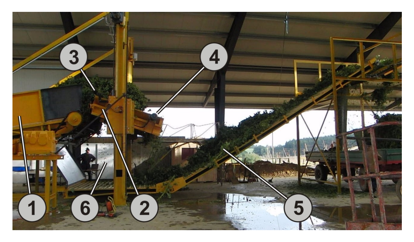
Figure 4. Testing facility of the prototype for automated feeding of the picking machine. Legend: (1) – conveyor; (2) – mechanism for cutting; (3) – cutter bar; (4) – pre-picking unit; (5)– feeding mechanism; (6) – electrical cabinet with the PLC

pieces are transported to further processing continuously. The testing facility is controlled by a PLC which is mounted in the electrical cabinet (6). The first prototype of the system is shown in the figure 4.