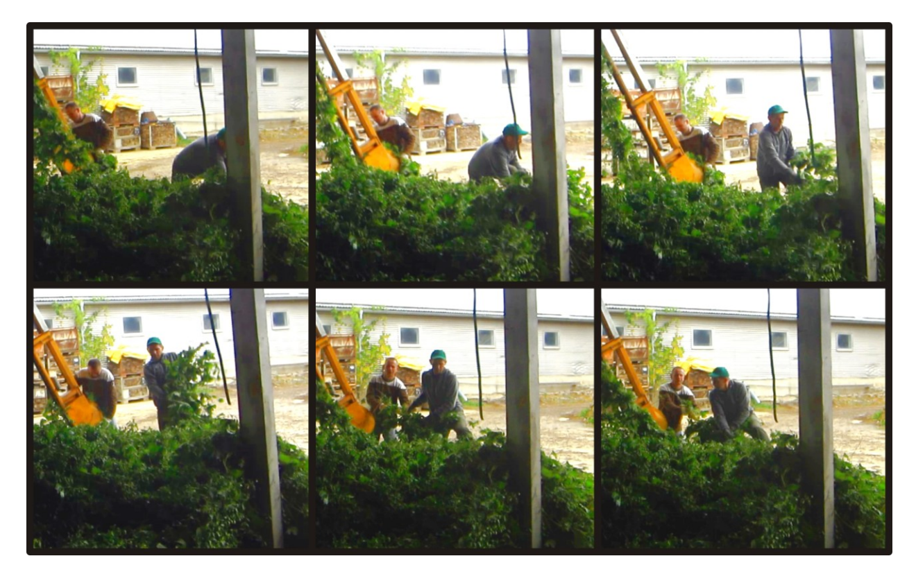
Figure 1. Manual feeding of traditional picking machines

Taking into consideration the different aspects of the stress related to the loading of the picking machine, the number of seasonal workers willing to carry out this task decreased in the past years. The expenditure on manual labour also increased constantly in recent years affecting the hop production in Germany. Hop production is concentrated on relatively small areas and carried out by a modest number of farmers (e.g. the number of involved farms decreased from 8591 to 1294 in the period from 1973 to 2012, while the total area under hop stayed on the same level in this period). Thus, the processing quantities and machine capacities on each farm increased. Hop picking machines are integrated into buildings, are expensive and can be characterised by a high level of complexity, with already identified potentials for optimisation. The most important international and national agricultural machinery manufacturers, however, showed little interest to contribute on the development, because of the small market share and the introduction of new technologies and machines remain on the moderate level.