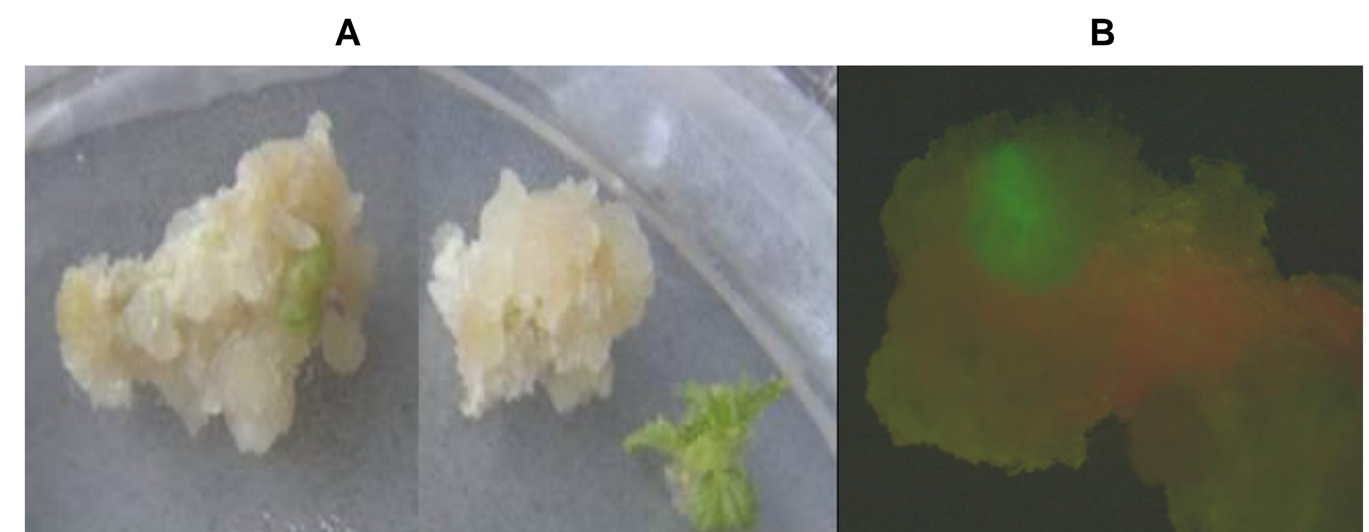
Figure 3: A: Two-week old calli formation; B: GFP signal in callus tissue.